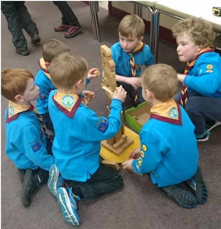
Teamwork at the District Challenge