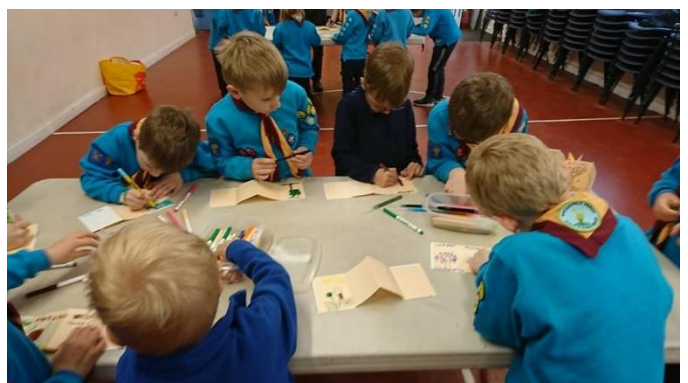
Book Reader Badge