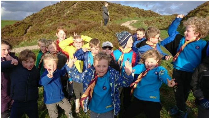
Exploring Tegg's Nose