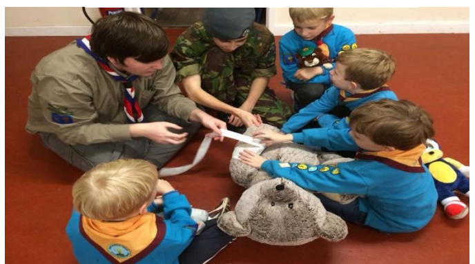
Young Leaders teaching First Aid