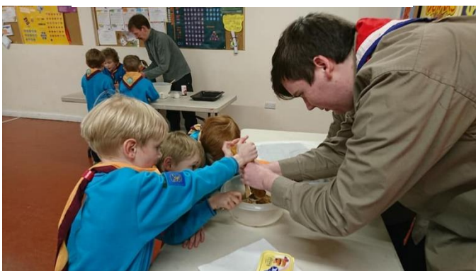
Young Leader teaching cooking