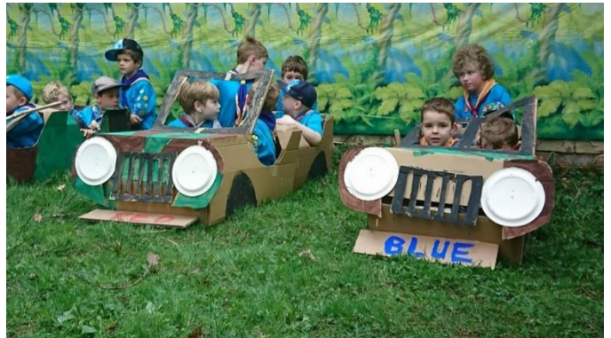
Joint Sleepover with other Colonies