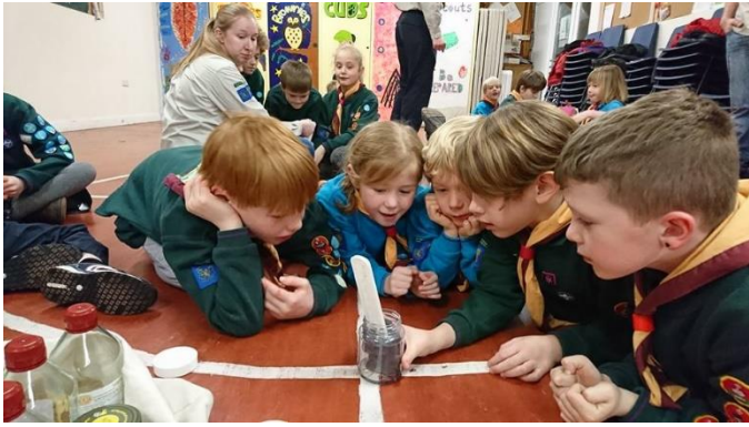
Science badge with the Cubs