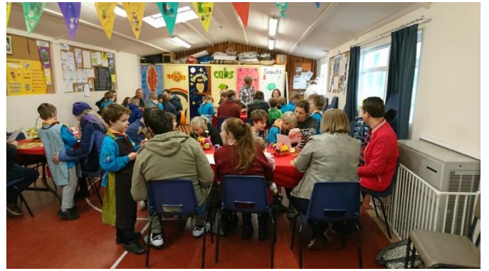
Café for Beaver Scout families